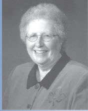
Coleen J. Seng, Mayor