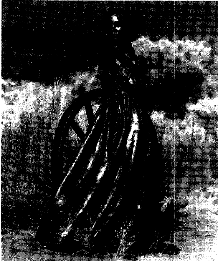
NO TURNING BACK 60 by 50 by 26 inches