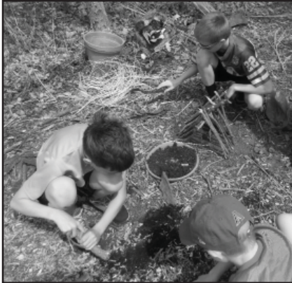
Fairy house/fort building

Friday, October 17th we will be hosting a free family event full of hands-on learning activities, wildlife illustration, photography, geocaching, turtles of Nebraska, guided nature walks, story telling, and a lively campfire. Everyone is encouraged to take part in the fun! There will be food available for purchase from vendors and hayrack rides for $3 a person.