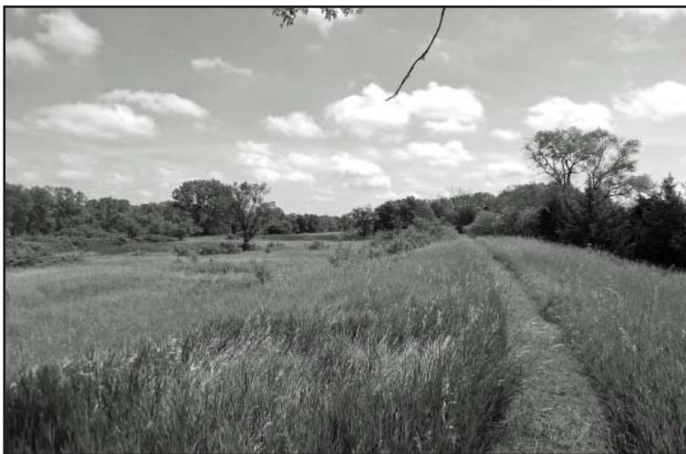
Verley Trail heading east from Coyote Point

Hands-on Activities 4-6:30 pm Indoor Animal Displays 4-7 pm Hayrack Rides 4-8 pm Campfire Activities 6-8 pm