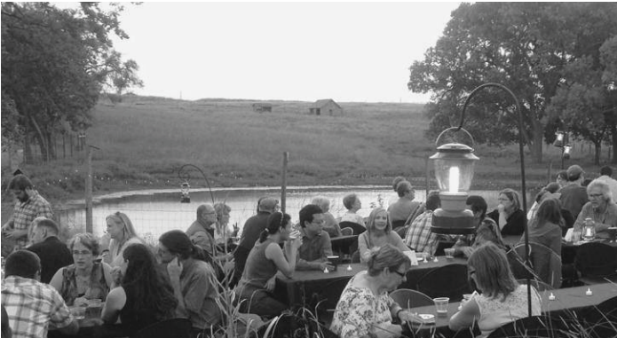
View from Beer, Brats and Bison.

Experience one of our planet's most spectacular wildlife migrations. Visit the Nebraska Nature and Visitor Center, travel rural roads to see the cranes foraging and dancing in the fields, then watch and listen to them return to the Platte River at sunset from a Rowe Sanctuary blind. The fee includes van transportation, dinner and blind costs. Must have the ability to walk uneven trails in low light with a guide. Registration and payment required by February 21 for blind reservations.