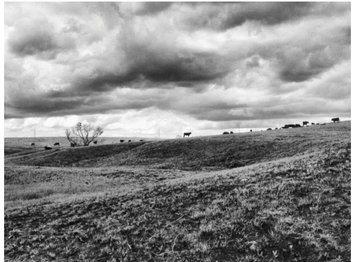
A section of the prairie that was burned and had cows grazing on the cool season grass.

Thank you everyone who helped us celebrate our 50th Anniversary! We are thrilled to embark on another 50 years of wildlife and habitat preservation, environmental education and community involvement.