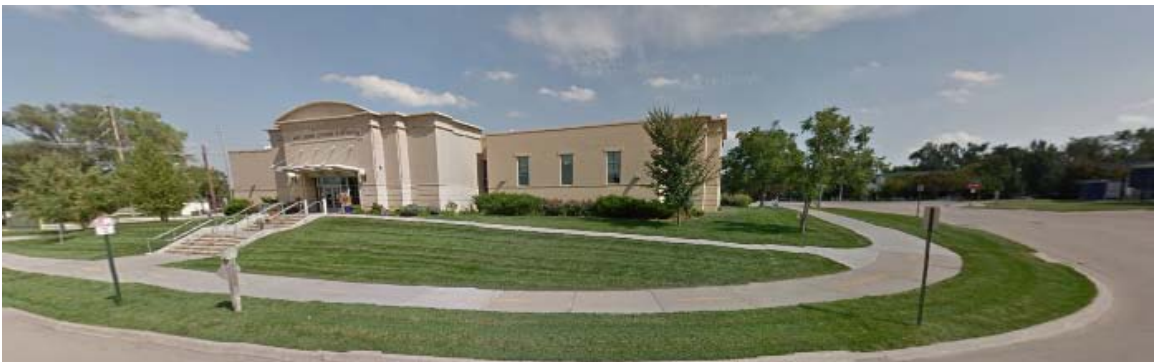
View from west of Matt Talbot Kitchen & Outreach, main entrance

While the addition has a much larger footprint than the original building, it is carefully designed and located and the site is landscaped so as to allow the former library to dominate the principal views from 27 th Street, while MTKO has a handsome and dignified entrance and overall appearance for clients, volunteers and staff approaching the building from the south and west.