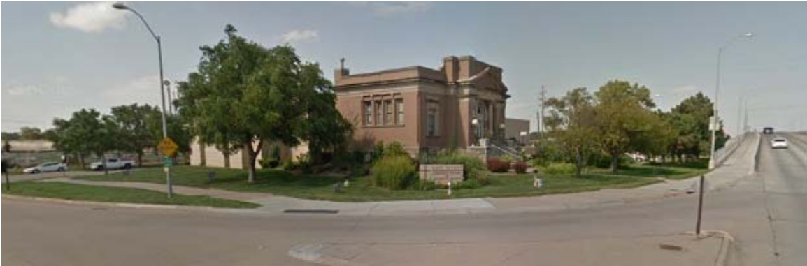
View from SE of MTKO addition to NE Carnegie Library