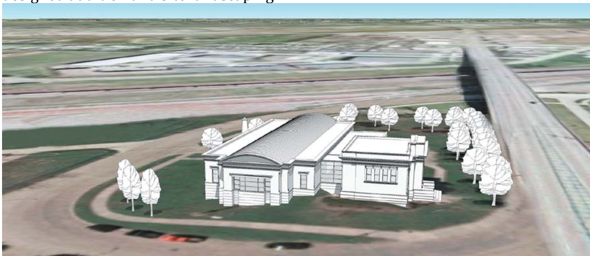
Expansion plan, 2009

When Matt Talbot Kitchen was seeking a new home in 2009, NeighborWorks, the City of Lincoln, and Matt Talbot agency agreed to a coordinated plan to transfer ownership of the former library to Matt Talbot and relocate NeighborWorks back into the Hawley/Malone neighborhood. As part of that plan, the City requested landmark designation for the property and Matt Talbot proposed a major addition to the building for office space and dining facilities. Upon review, the Preservation Commission recommended approval of the designation and the thoughtfully designed addition and site landscaping.