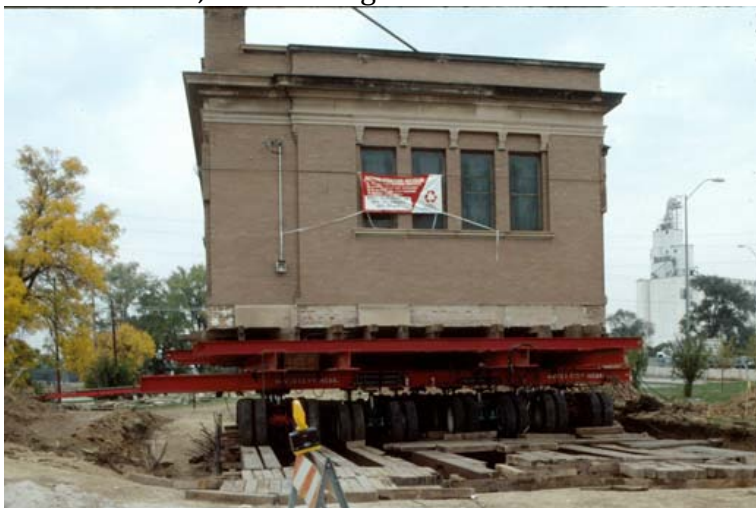
View from south, 1992

A decade later, the building was moved a mile north to 27 th and Center Streets.