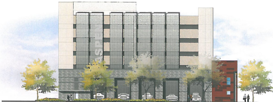
GARAGE EAST ELEVATION