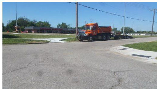
Dunn Avenue Connection