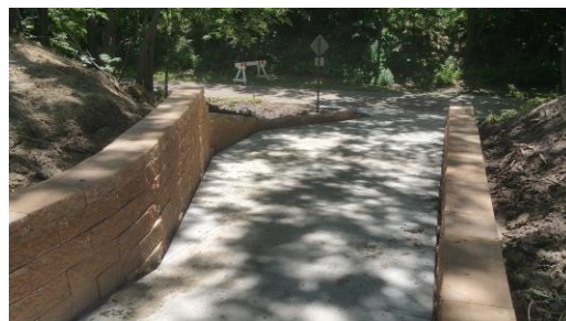
52 nd Street Connection