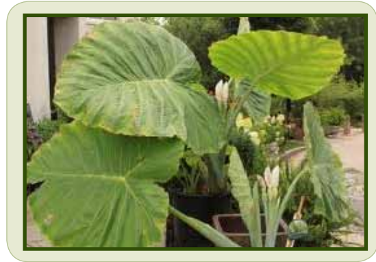
Elephant Ears 'Thai Giant'