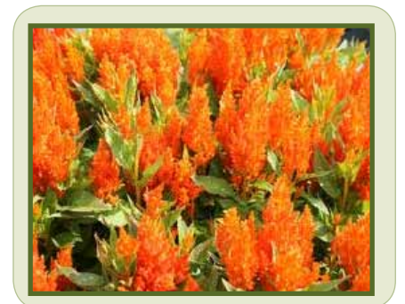
Cockscomb 'Fresh Look Orange'