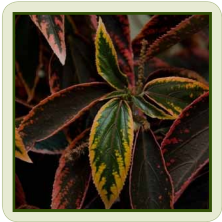
Copper Leaf Plant