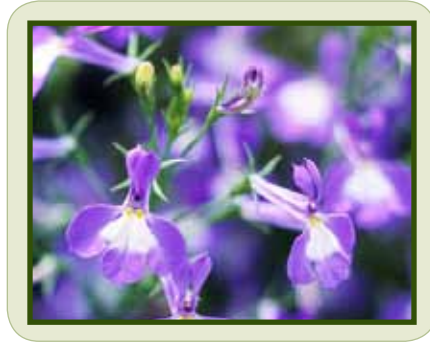
Lobelia 'Techno Heat'