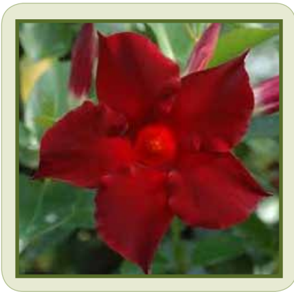
Mandevilla 'Vogue Ruby'

Color: grey Exposure: full sun to part shade