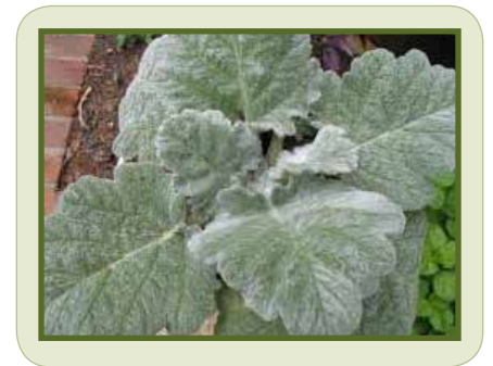
Silver Sage 'Hobbits Foot'

Color: grey Exposure: full sun to part shade