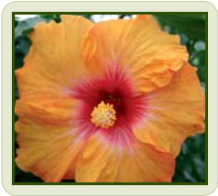
Hibiscus 'Florida Orange' & 'Euterpe'