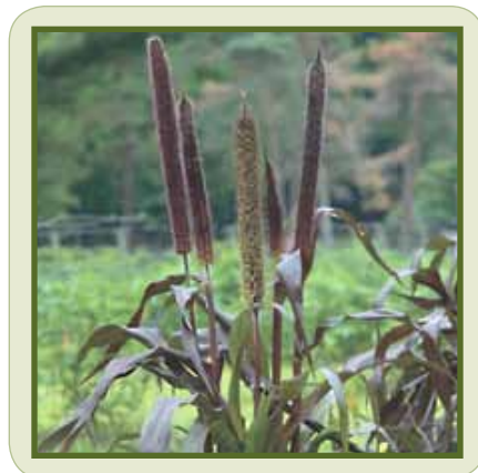
Millet 'Purple Baron'

Color: purple and green Exposure: full sun