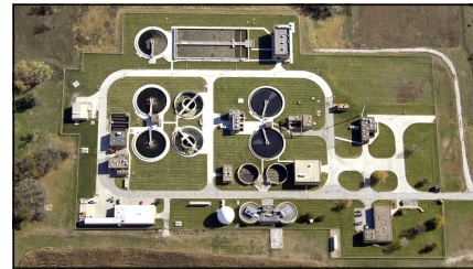
Northeast Water Resource Recovery Facility