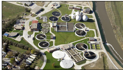
Theresa Street Water Resource Recovery Facility

When you flush your toilet, do you think about where that water goes? Underneath and throughout Lincoln are more than 1,000 miles of wastewater pipe lines and 15 pumping stations that keep the wastewater flowing to two municipal water resource recovery facilities: the Theresa Street Water Resource Recovery Facility and the Northeast Water Resource Recovery Facility.