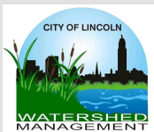
Figure 6. Municipal Facility Inspections

Prepared By: WICATS, March 7 2024, F:\Eng Services\Asset Registry\GIS Data\WSMGIS\NPDES\2023_yearly\NPDES2023_annual.aprx